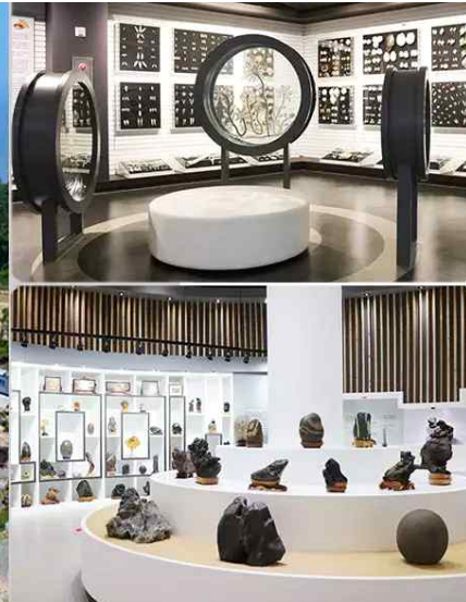
Shinan 1004 Museum Park - 8/4(Mon) afternoon

Due to budget cuts, we kindly ask for your understanding that each overseas team is limited to a maximum of 15 participants. Thank you for your cooperation.