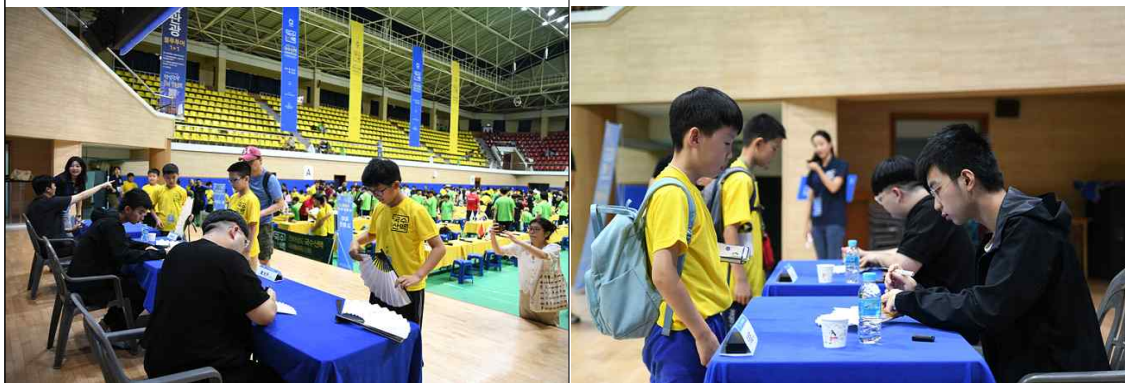
Fan meeting with professional player