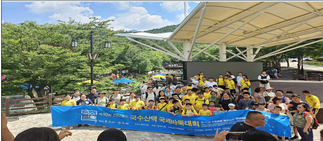
Sightseeing in Ganjin-Youngam Kichan Land